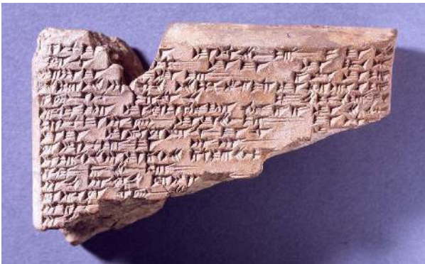
Upper part of a clay tablet, part of the Creation legend Enuma elish.

In addition to the text itself, the ancient cultural context is helpful in understanding the author's intended meaning. Over the past century, biblical scholars have made significant advances in understanding ANE culture, the context in which Genesis was written. Babylonian and Egyptian creation stories predating Genesis have been discovered that suggest that Genesis was written as a response to polytheism. Countering a culture in which celestial bodies were worshiped by earth dwellers, Genesis describes their purpose in terms of providing service (light and calendrical time) to earth dwellers.