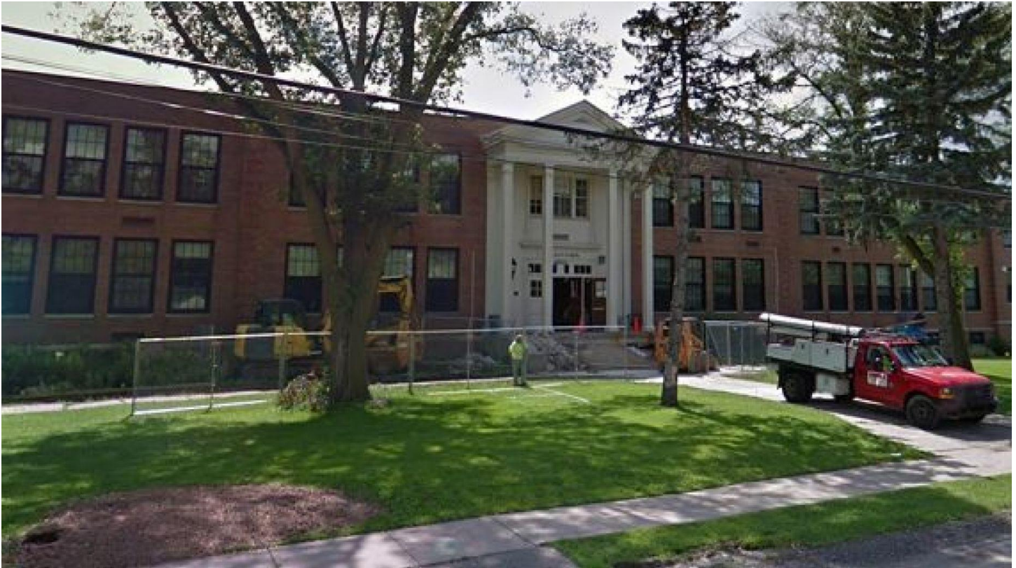
Parents at a Frank Allis Elementary School in Madison, Wisc. expressed outrage after a science teacher showed a video on transgenderism to k-5th grade without parents' permission.