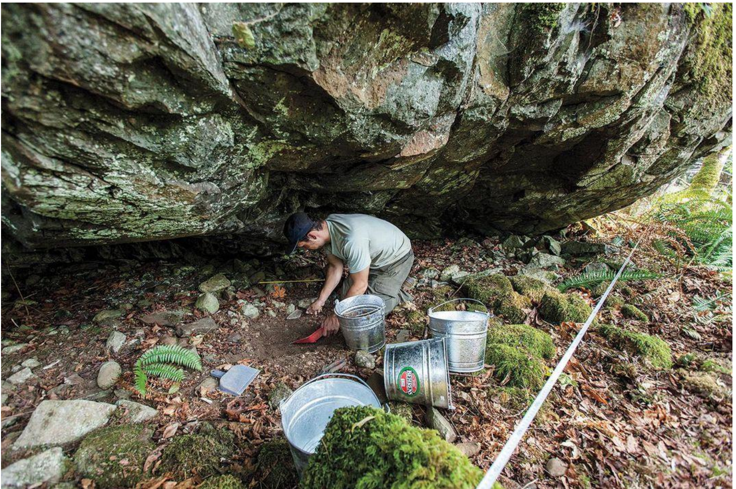
Digging on Quadra Island, about 150 feet above today's sea level. (Al Mackie)

The site was located on a tranquil cove whose shores were thick with hemlock and cedar. When I arrived, the team was just finishing several days of digging, the latest in a series of excavations along the British Columbia coast that had unearthed artifacts from as far back as 14,000 years ago—among the oldest in North America.