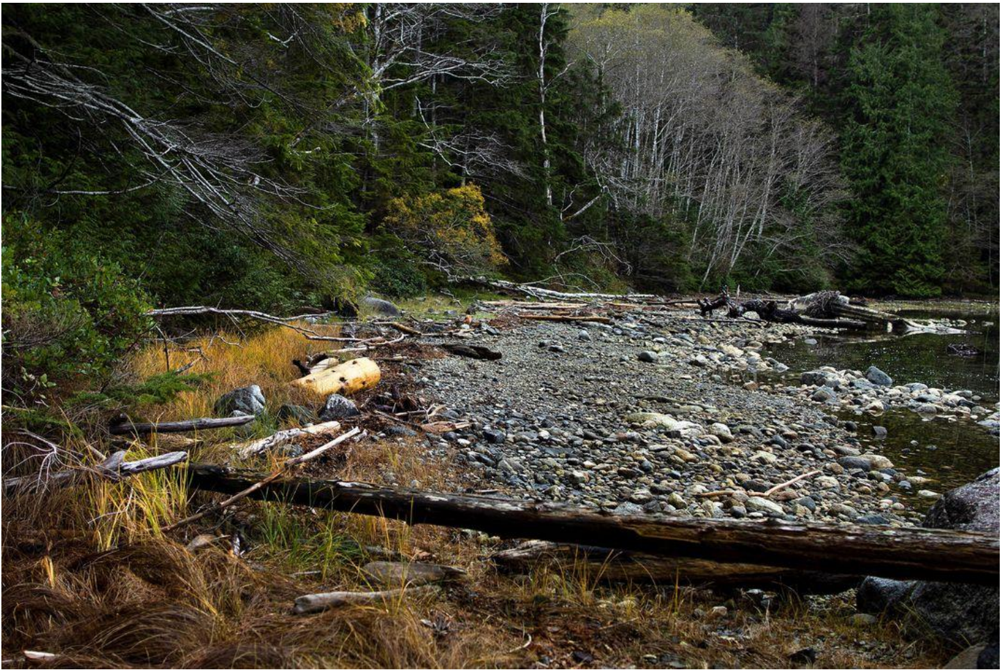
Yeatman Cove on Quadra Island, British Columbia. The appearance of this area suggests that humans lived here a long time, maybe even thousands of years.