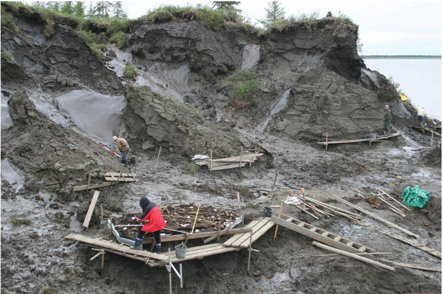
Excavations along the Yana River in Siberia in 2007, where cultural artifacts and human remains were found beneath 23 feet of frozen sediment.