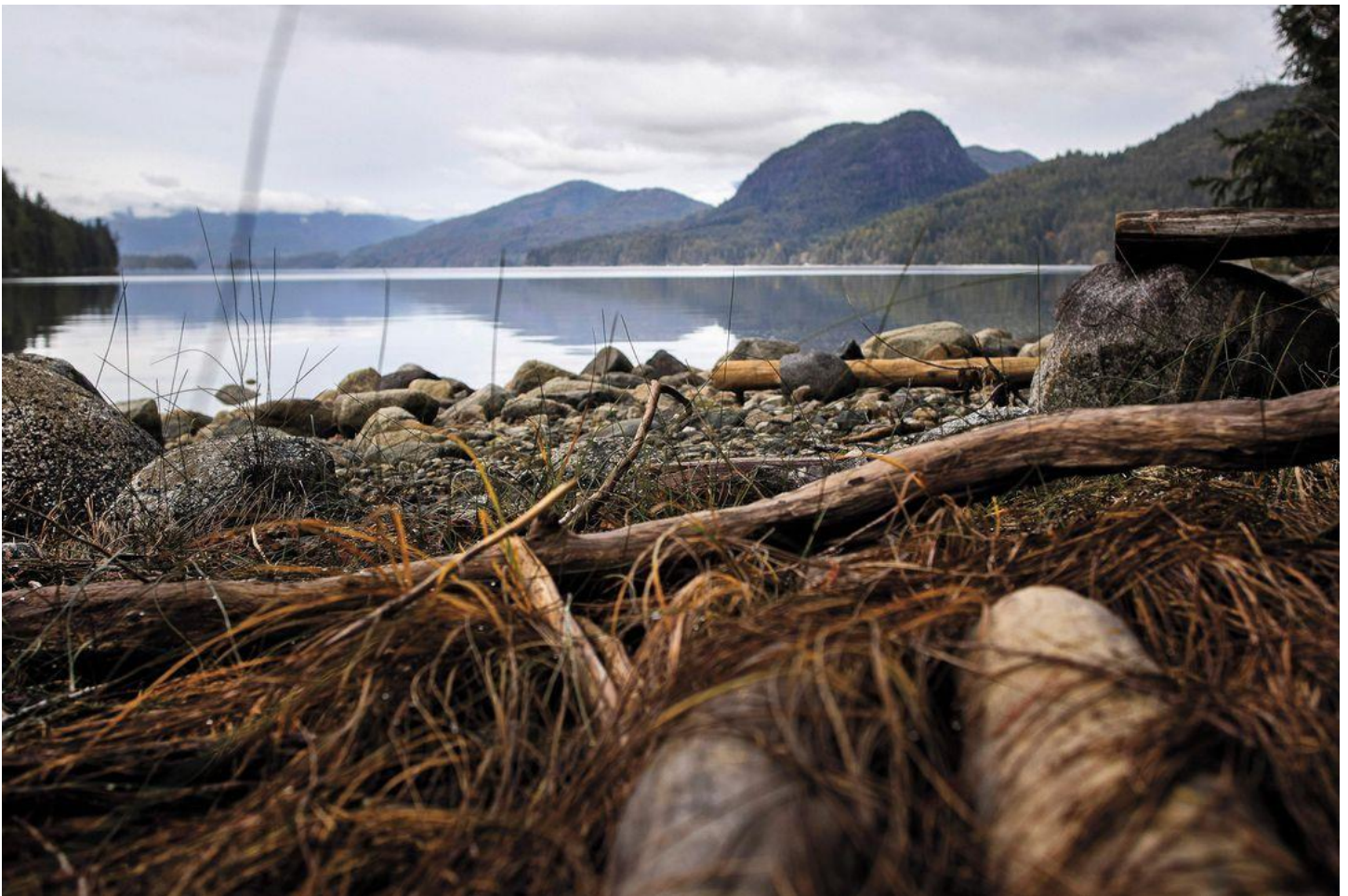
Yeatman Bay, near one of the excavation sites on Quadra Island.

An axiom in archaeology is that the earliest discovered site is almost certainly not the first place of human habitation, just the oldest one archaeologists have found so far. And if the work of a host of evolutionary geneticists is correct, humans may already have been on the North American side of the Bering Land Bridge about 20,000 years ago.