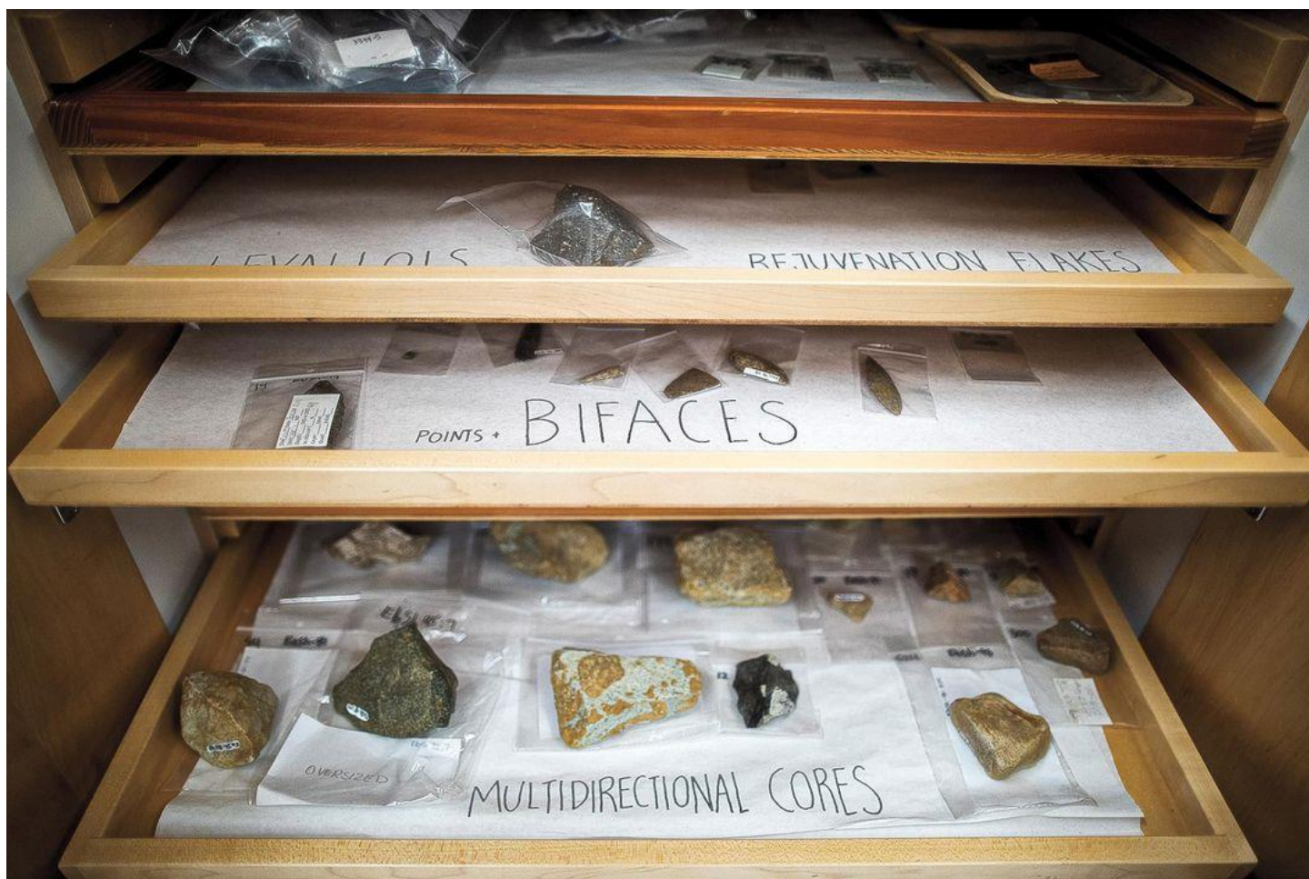
Artifacts shelved by type at the University of Victoria. A biface is a stone implement flaked on both sides; a multidirectional core is a tool used to make weapons.

But the ice sheets weighed billions of tons, and as they vanished, an immense weight was lifted from the earth's crust, allowing it to bounce back like a foam pad. In some places, Fedje says, the coast of British Columbia rebounded more than 600 feet in a few thousand years. The changes were happening so rapidly that they would have been noticeable on an almost year-to-year basis.